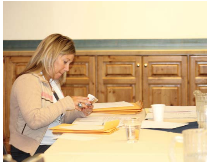
Thanks to Mindy Tyser for conducting the audit in Red Lodge.