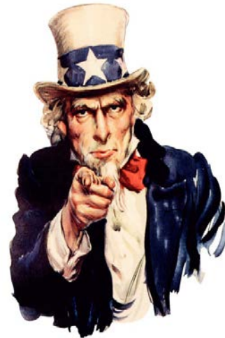
The IRA needs you!